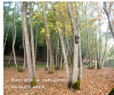
BIRD BOX IN UNPLANTED WILDLIFE AREA

PEOPLE We support dozens of community-based non-profits and endeavor to create a more sustainable and supportive work environment for our Knights Bridge team.