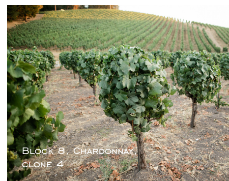
BLOCK 8, CHARDONNAY CLONE 4